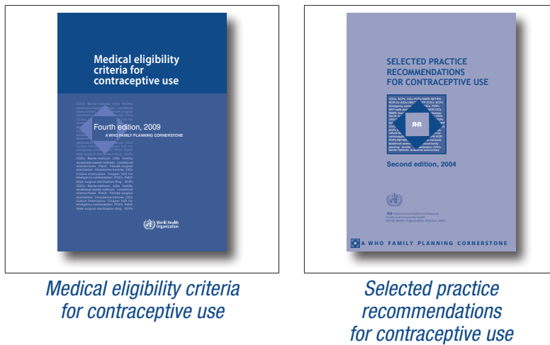
Figure 1. The four cornerstones of family planning guidance

These are evidence-based guidance and consensus-driven guidelines. They provide recommendations made by expert working groups based on an appraisal of relevant evidence. They are reviewed and updated in a timely manner.